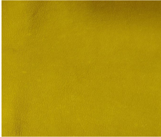
TOP DYEING - 2%