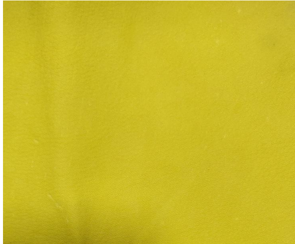
TOP DYEING - 2%