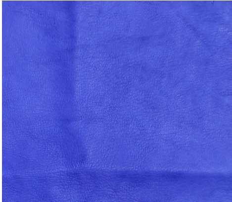
TOP DYEING - 2%