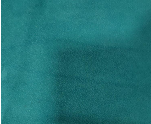
TOP DYEING - 2%