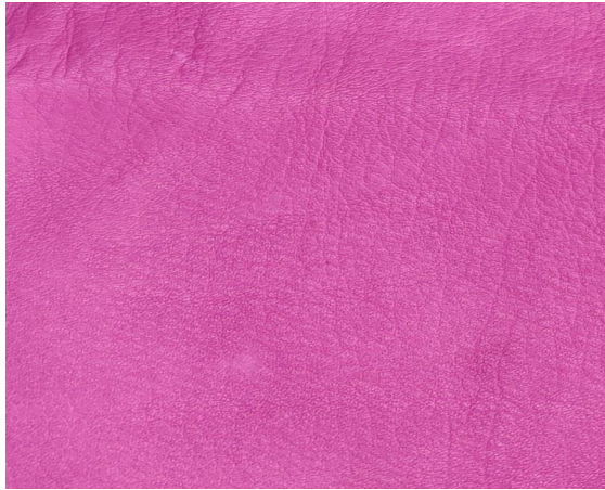
TOP DYEING - 2%