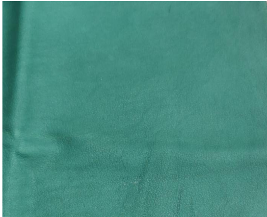
TOP DYEING - 2%