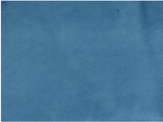
TOP DYEING - 2%