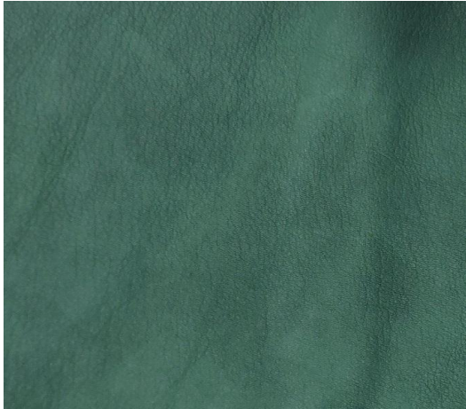
TOP DYEING - 2%