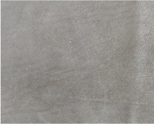
TOP DYEING - 2%