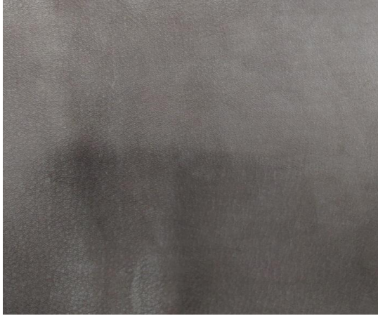
TOP DYEING - 2%