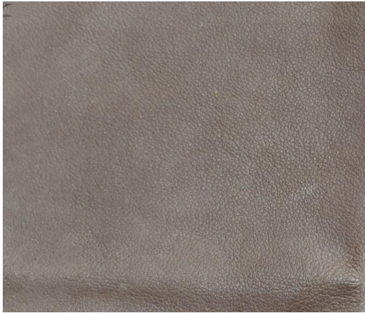
TOP DYEING - 2%