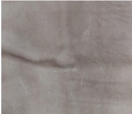
TOP DYEING - 2%