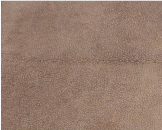
TOP DYEING - 2%