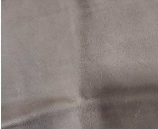
TOP DYEING - 2%