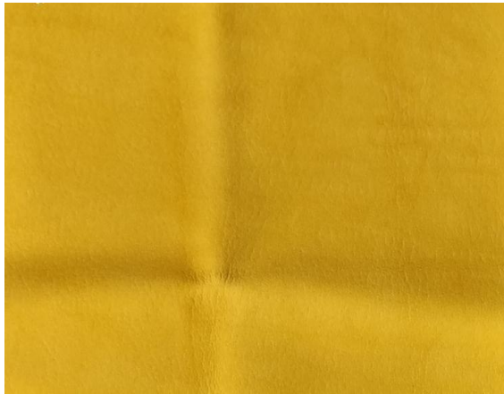
TOP DYEING - 2%