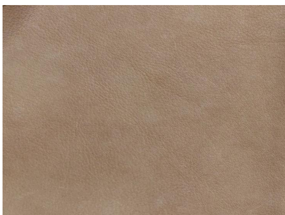
TOP DYEING - 2%