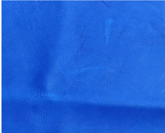
TOP DYEING - 2%