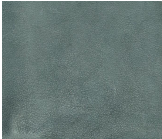
TOP DYEING - 3%