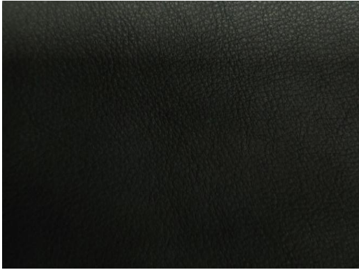
TOP DYEING - 3%